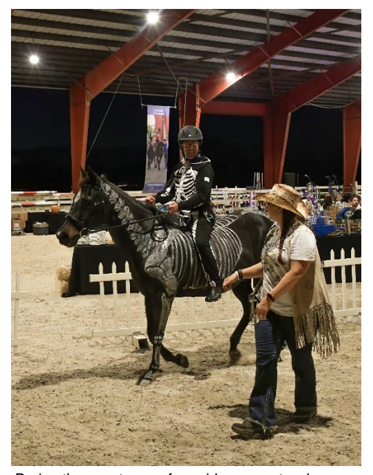
During the event, one of our riders mounts a horse painted as a skeleton, while wearing his own costume to illustrate the 3-dimensional movement and how it benefits those with special needs.